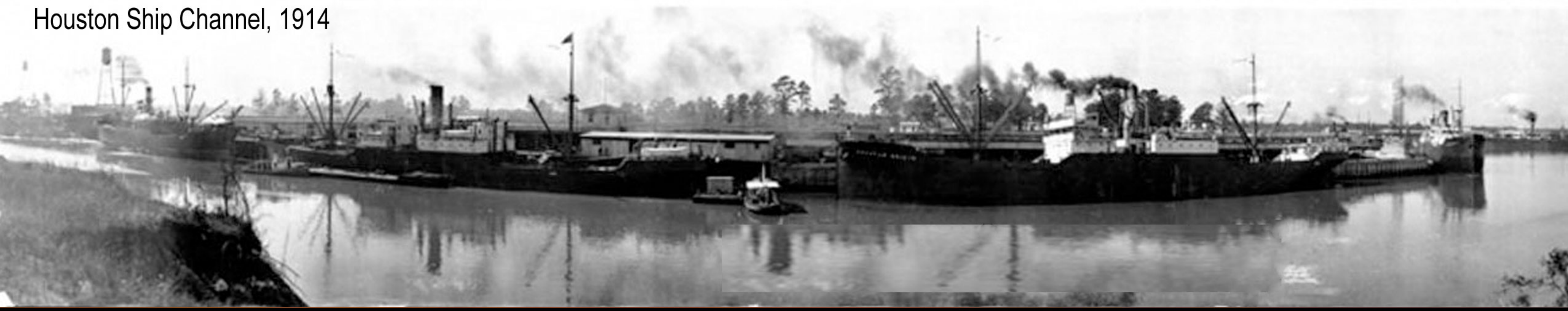
Houston Ship Channel, 1914