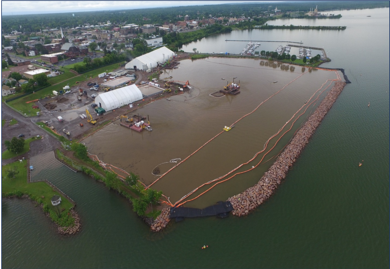
Mechanical dredging operations at the Ashland Phase 2 Wet Dredge—Full Scale project.