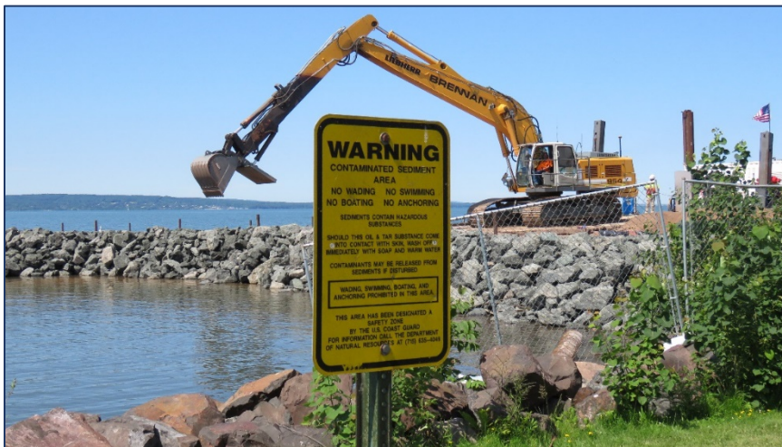
Figure 1. Operations begin along Lake Superior’s Chequamegon Bay, restoring a site known for contamination back to quiescence.

The FE JV and J.F. Brennan Company, Inc. (Brennan) nominated the Ashland Phase 2 Wet Dredge—Full Scale project as The Western Dredging Association (WEDA) Environmental Excellence Award for a multitude of reasons. First and foremost, the work exemplifies the heart and soul of successful