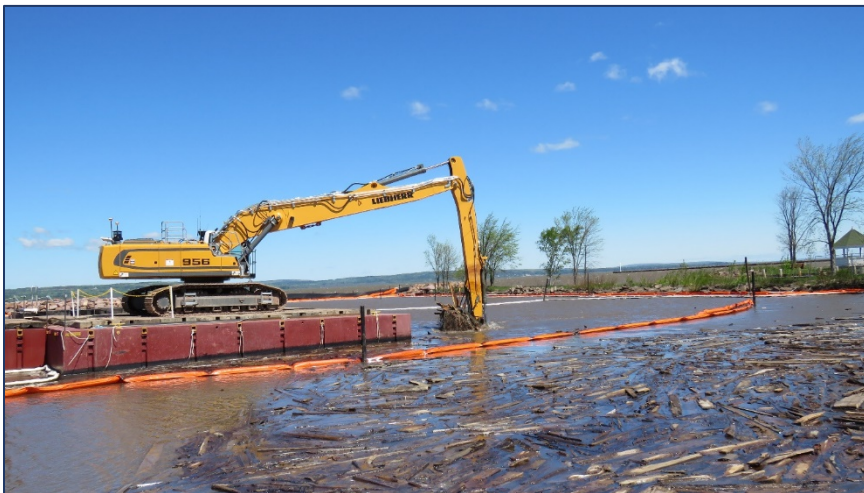
Figure 3. Wood debris present in the top layer of the dredge prism.

Other challenges encountered throughout the course of the project include those related to material management both in and out of water, and safety concerns resulting from the removal of large slab lumber and logs inundated with COCs. Active communication and teamwork by all involved parties mitigated these challenges and many others.