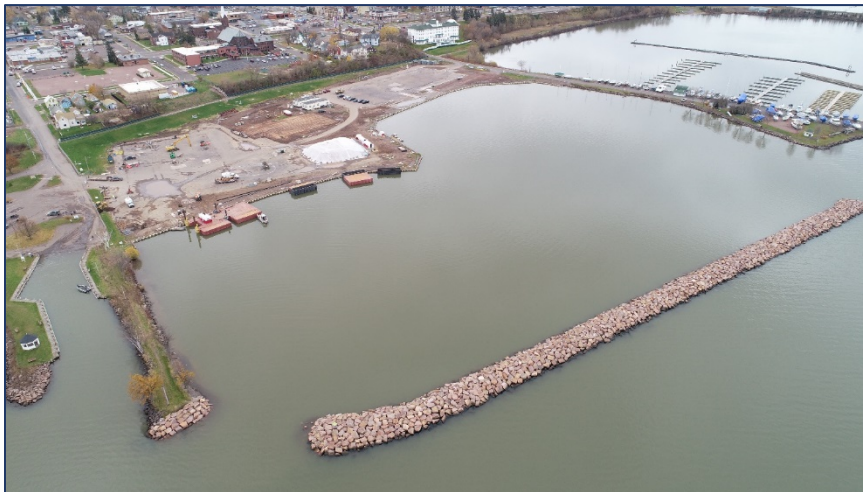
Figure 5. Post-remediation aerial view.

Stakeholders spent a great deal of time preparing the community for the performance of the project. During project execution, social media sites, local news, and public meetings kept the community informed of progress. As part of the redevelopment effort, the local public has been invited to provide input on the planning for their revitalized waterfront area, furthering the successful practice of community involvement.