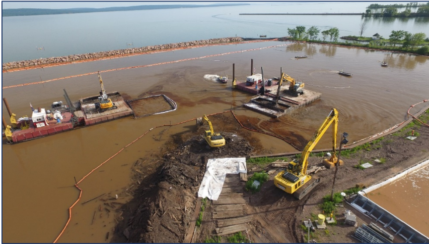
Figure 2. Example of sheen observed during mechanical dredging operation.

threatened to transport turbid water out of the work area. Through teamwork and innovation, the project team successfully mitigated these two issues with practical practices in the field, implementing active sheen capture through use of absorbent materials slowly towed behind vessels and applying Aluminum Sulfate (Alum) to effectively control turbidity in the active work area.