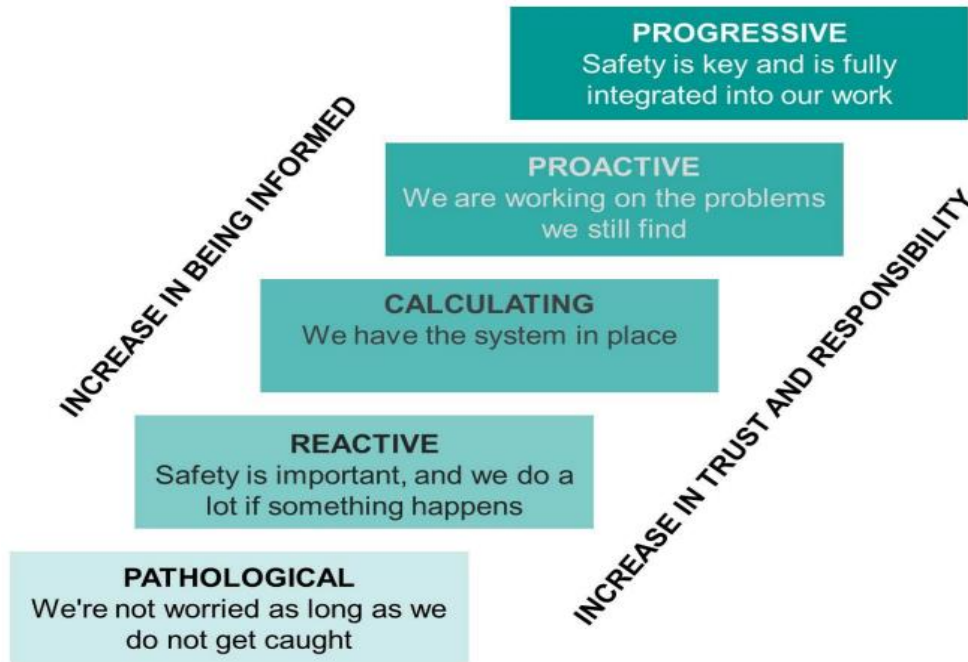
Figure 1 from ( https://www.safetycultureladder.com/wp-content/uploads/2021/01/Safety-Culture-Ladder-Manual_4.0_ENUK_def.pdf ) has been copied with the permission of NEN at Delft (the Netherlands) – www.nen.nl

Because safety culture improvement can only begin from the place a company occupies when it decides to do this work in earnest, there is no right or wrong “first step”; rather, we must assess our respective situations and decide what actions will make the most reliable progress as we begin.