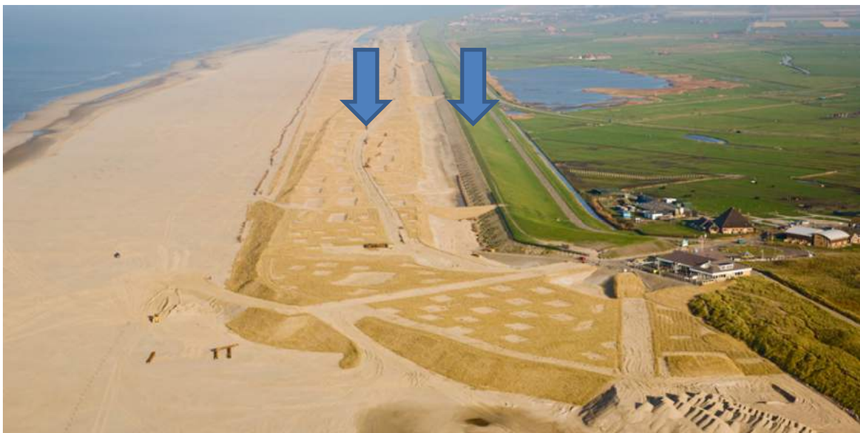
Innovative step change: from hard dike protection (right arrow) to a sandy solution (left arrow)