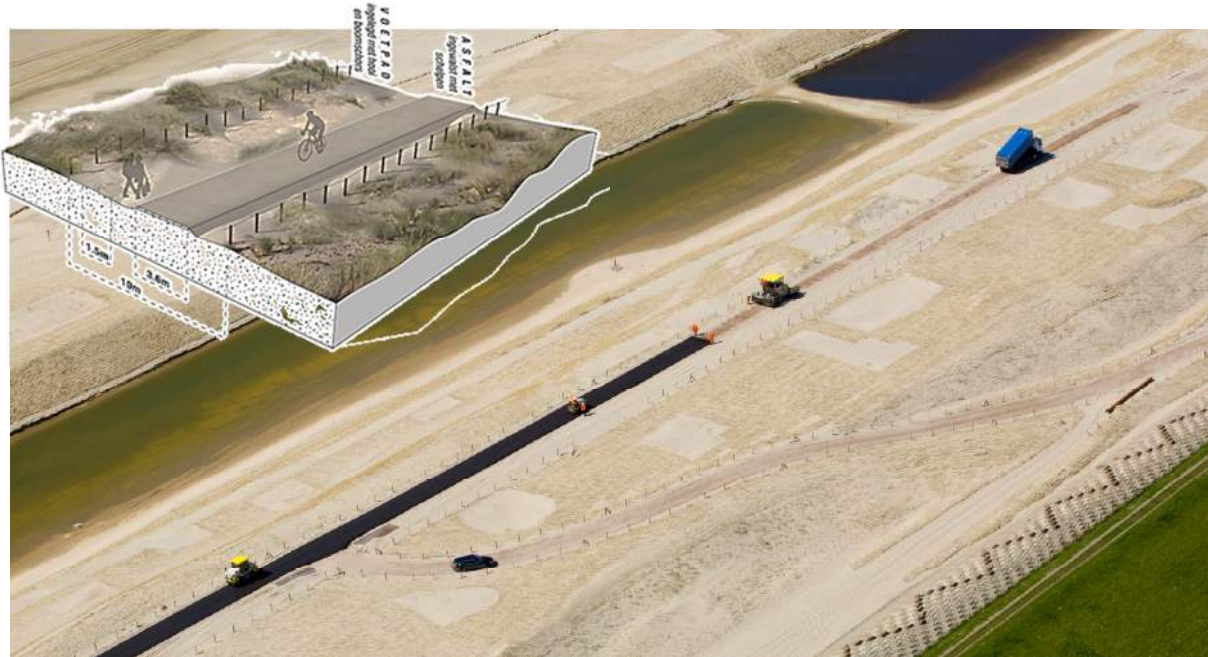
Design and construction of footpaths and cycling paths