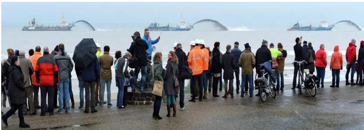
Attention of the public during the start of the construction works

During tendering and execution, stakeholder interaction has been one of the key focus points of the realization of the project. During a Dialogue Phase in the tender, interaction between tendering contractors and relevant stakeholders including the public were organised. Also after award, interaction with the public was well organised as the works attracted quite some visitors. Next to information at the project location and a visitors centre, also effective efforts were made to inform the public online, both from the perspective of the Client and the contracting consortium (see for instance: www.kustopkracht.nl ).