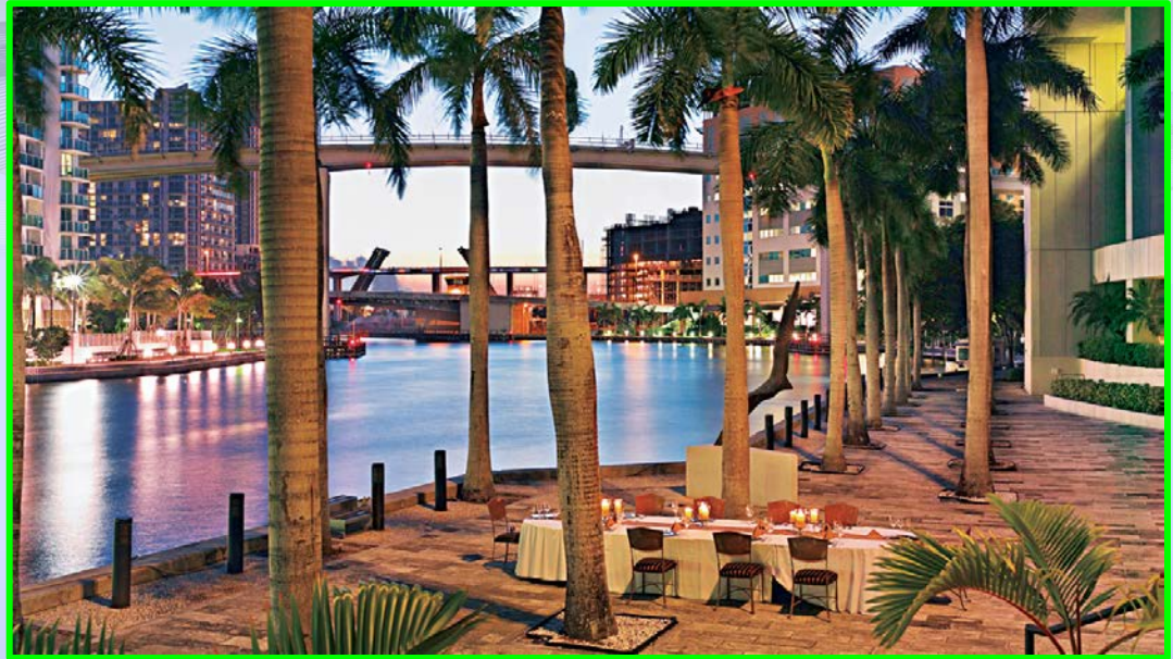
OUTSIDE EXHIBITORS HALL