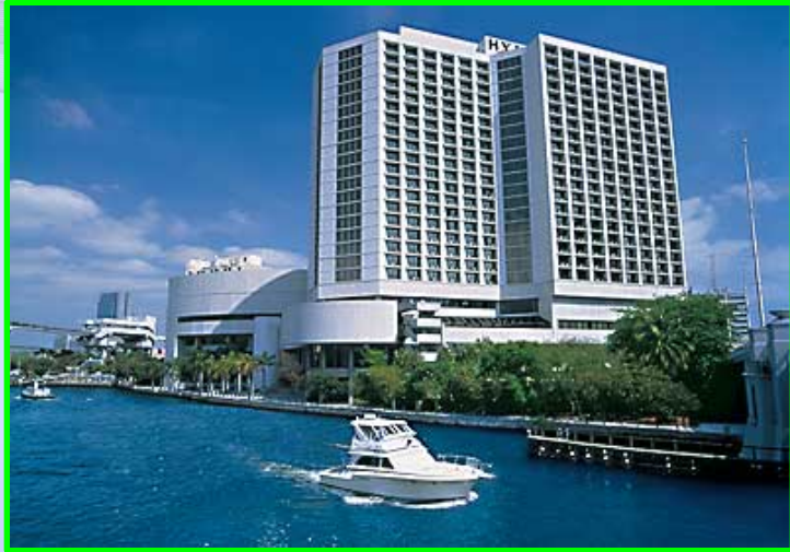
HYATT REGENCY MIAMI