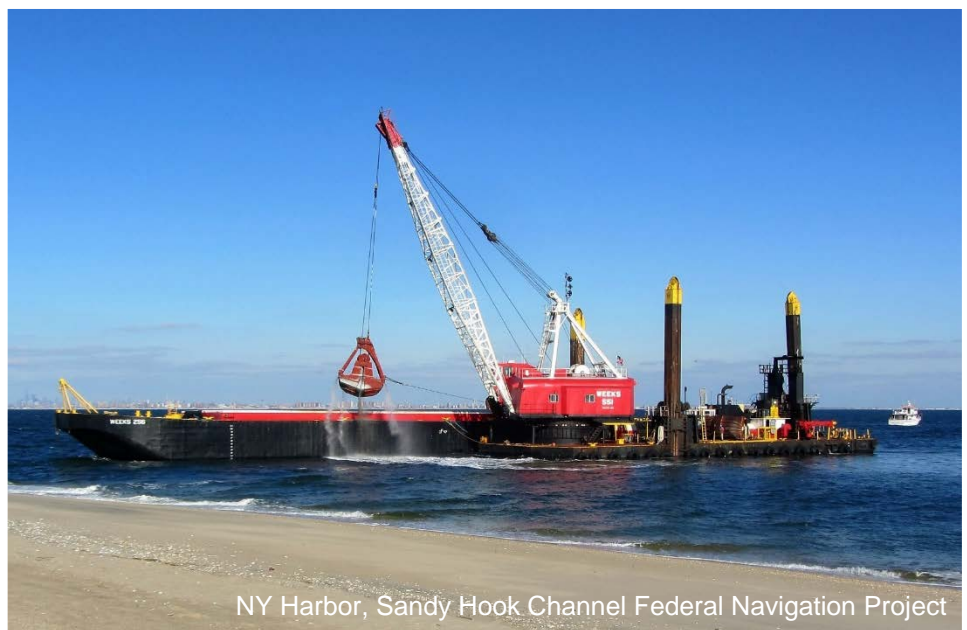
NY Harbor, Sandy Hook Channel Federal Navigation Project