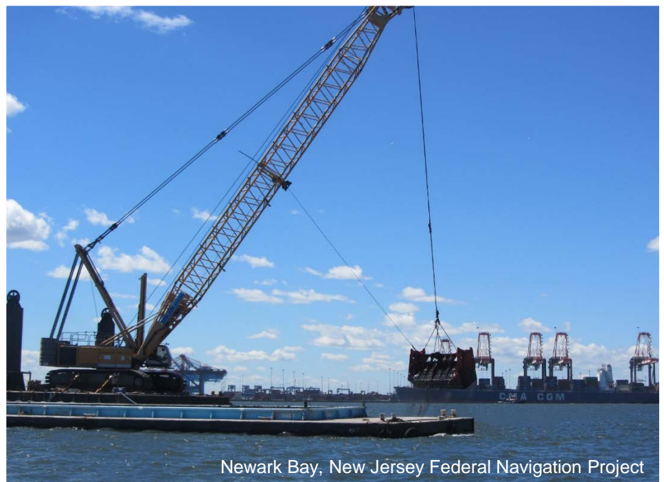
Newark Bay, New Jersey Federal Navigation Project

US Army Corps of Engineers® New York District