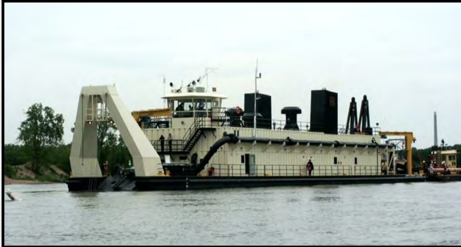
Hydraulic Dredge GOETZ •20-inch cutterhead pipeline dredge