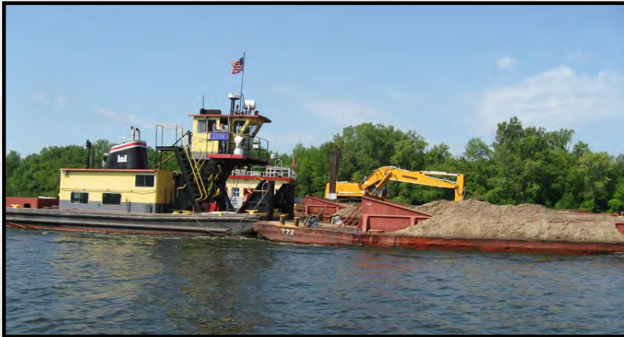
Mechanical Maintenance & Repair Unit