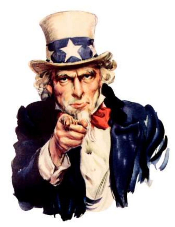
Thanks for all you do!