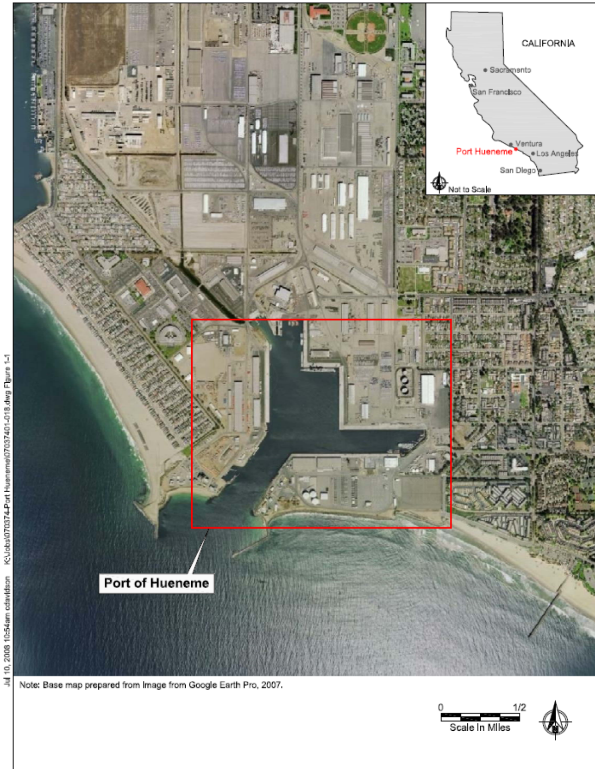
Figure 1. Site location map.