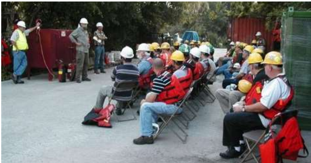
Figure 1. Project launch meeting led by project management team.

One of the main goals of a re-vamped project launch meeting is to make it the kind of meeting that crews cannot afford and do not want to miss . Through successfully planning, conducting, and following up on the meeting, you are ensuring your project is set up for safety success from day one. As illustrated in Figure 1 below, a carefully planned and executed project launch meeting will hold the attention of all participants. Note how everyone is paying attention to the facilitator—all eyes are front and not a cell phone in sight!