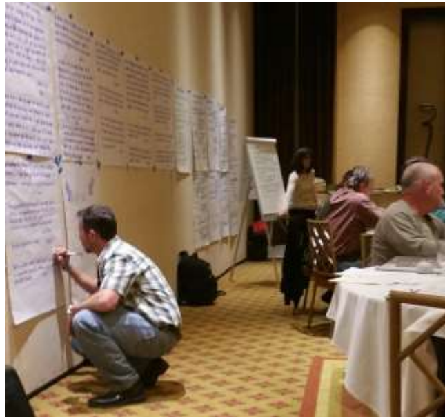
Figure 2. Project launch meeting participant actively flip charting ideas in conjunction with facilitator.